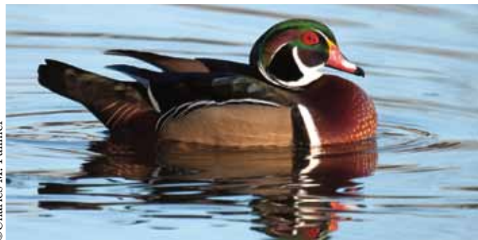
Wood duck drake